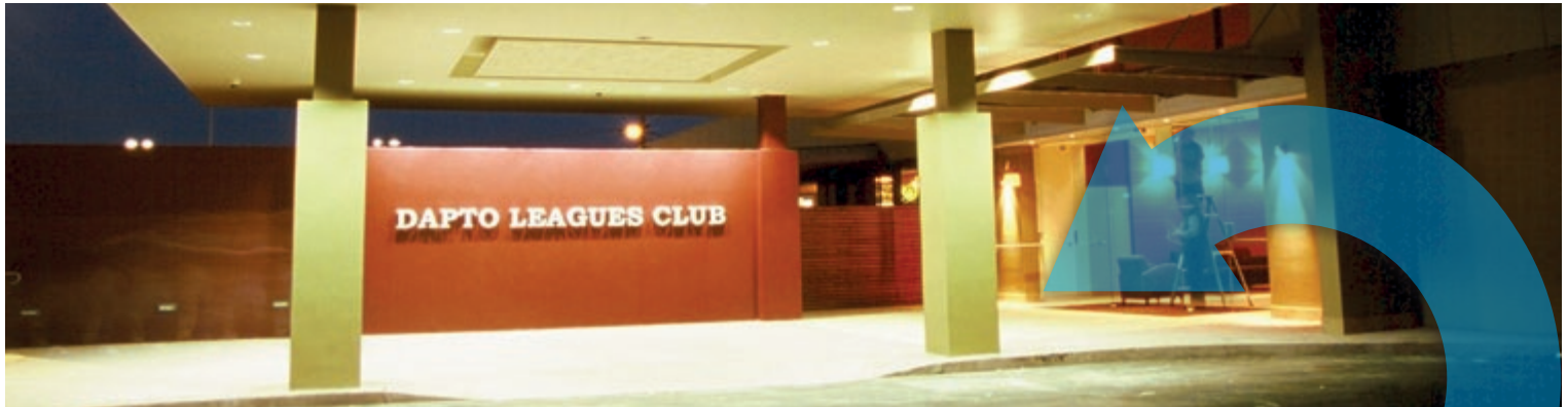
Dapto Leagues Club, 2013