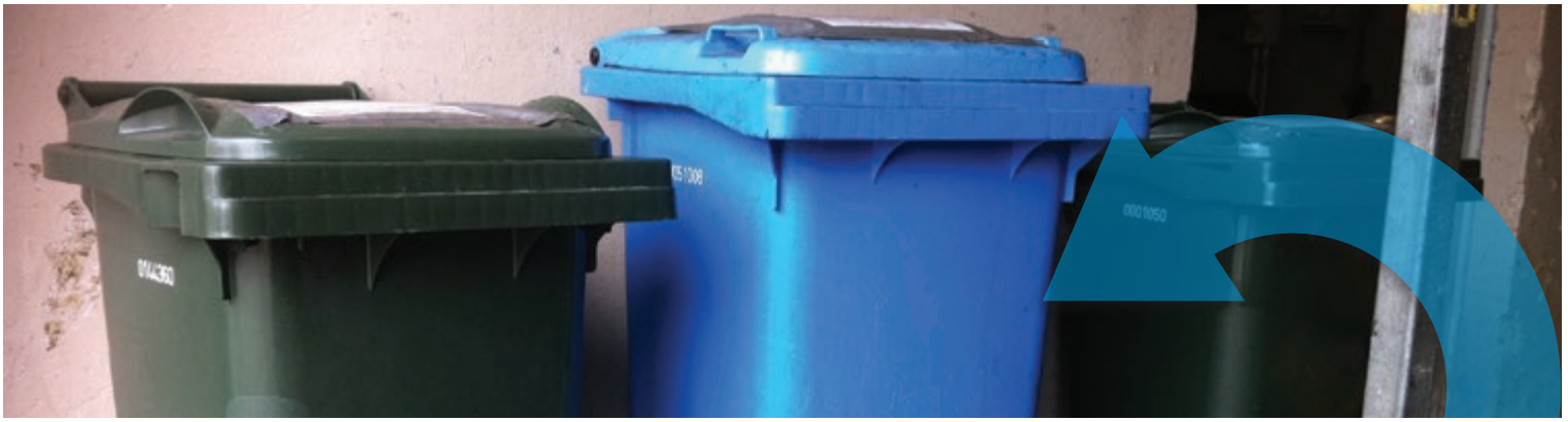
Dapto Leagues Club, 2013